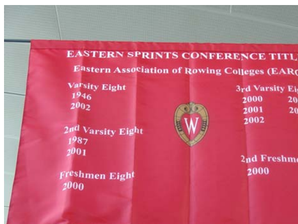
Banner above the Men's Erg Room celebrating the events and years Wisco won gold medals at the Eastern Sprints conference championships (donated by Friends)

Formed in December 2004, Friends of UW Men's Crew has contributed over $60,000 to the enhancement of history and tradition at the Porter Boathouse, to alumni development and to the men's crew program. In 2006, Friends gifted a Kohl Center-like banner over the men's erg room, celebrating UW's gold medal winners at the Eastern Sprints.